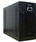
Battery cabinet (Optional)