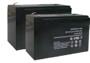
Optimized battery configuration 7Ah/9Ah (12V)